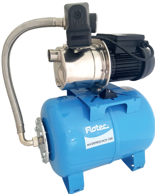
WATERPRESS INOX 1000 60/50